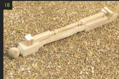
18 If the deck is greater than 600mm from the ground the handrail must be at least 1100mm from the deck surface.

For decks at higher levels consult an installer or constructional engineer for advice.