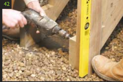
42 Holding the newel post vertical attach using landscape screws. Remember this post is resting on the ground and so should be supported by a concrete pad and post base.