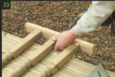
33 Lay the spindles flat and attach the bottom rail using the galvanised or stainless steel screws.