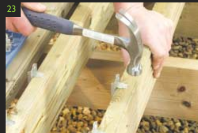
23 Nail the deck clips to the leading edge of the board. Space the deck clips about 50mm from each joist.