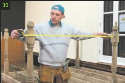
30 ATTACHING THE SPINDLES AND HANDRAIL Using a tape, measure the distance between the newels on the handrail and cut to length.