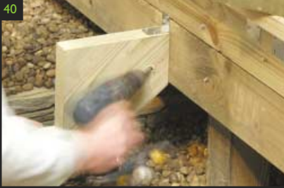
40 Secure the stringer by skew screwing to the beam or using a framing anchor.