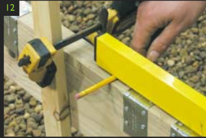
12 Adjust the height of the side beams to allow a slight fall in the deck away from the house. This will ensure the deck drains correctly.