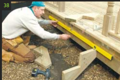
38 ADDING THE STEPS Mark the level along the length of the side beam.