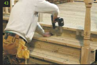
43 Starting from the bottom fix the boards by screwing through the face into the stair stringers.