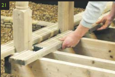
21 When notching the boards leave a 2 - 3mm gap around the post to allow for movement of the boards.