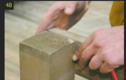
48 Ensuring the back rail is square with the newel post fix using two or more galvanised or stainless steel screws.