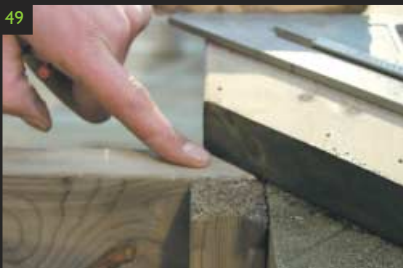
49 Cut the end of the top rail at a 45 degree mitre (for a 90 degree join) and fix using screws or deck rail ties.