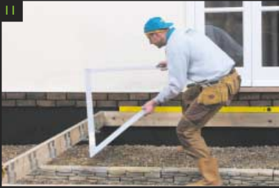
11 Check the beams are square using a 3, 4, 5 square, reinforcing all the corners using a framing anchor.