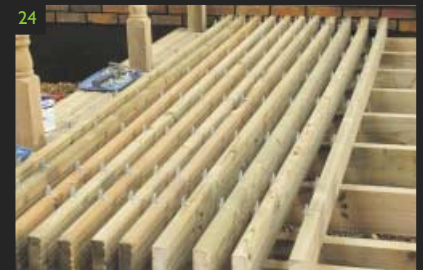
24 For speed of fitting prepare several boards in advance.