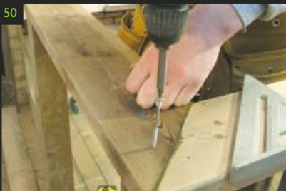
50 Cut the next piece of handrail at 45 degrees, butt to the original piece and fix using screws or deck rail ties.