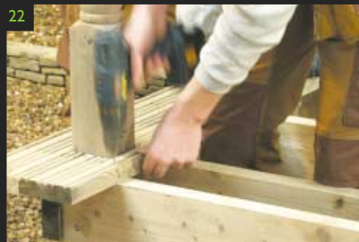
22 Attach the first two boards by screwing through the surface using galvanised or stainless steel deck screws.