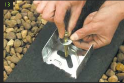
13 Accurately position the post bases and attach using expanding bolts.