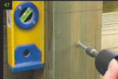
47 Holding the post vertical and with your mark at deck level, attach the post using the landscape screws.