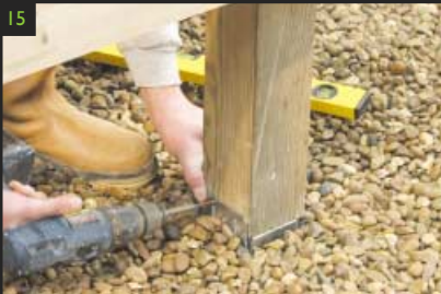
15 Where possible make sure the original treated end of the post is on the ground and attach using galvanised or stainless steel screws.