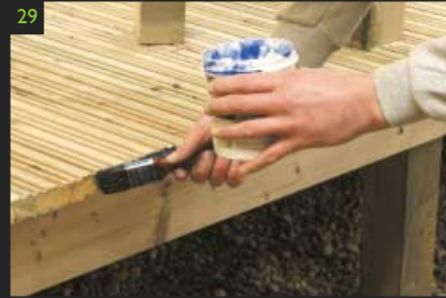
29 Don't forget to brush the cut ends with End-grain.