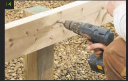
14 Attach the posts to the beams using coach bolts or landscape screws.