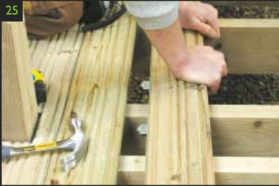
25 Push each board against the previously fixed board. The deck clips should fit under the fixed board. They should give a minimum of 3mm gap between the boards.