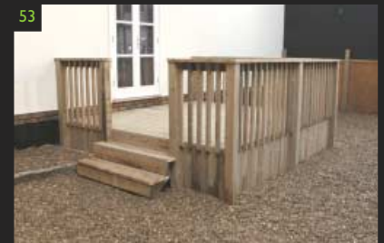
53 The finished deck fitted with the Arbordeck contemporary handrail.