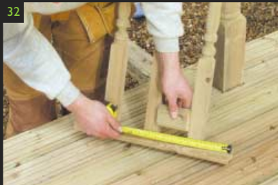
32 Use a spacer to ensure that the spindles are evenly spread. The maximum gap between the spindles must be no more than 100mm.