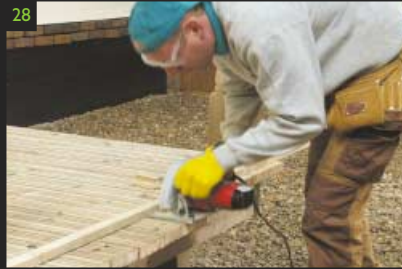
28 Using the guide line trim the excess board with a circular saw. Remove the guide baton.