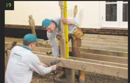
19 Ensure the newel post is vertical and attach it to the inside of the beams with landscape screws or coach bolts. Repeat this process around the inside perimeter of the deck, spacing the posts at a maximum of 1800mm centres.

For decks at higher levels consult an installer or constructional engineer for advice.