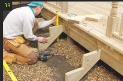
39 Checking for the vertical attach the furthest stair stringers.