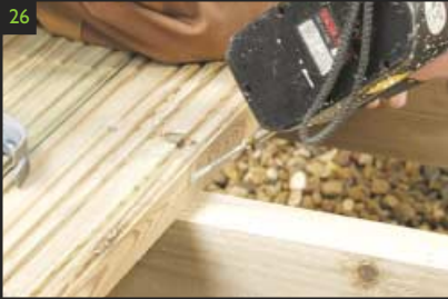
26 Skew screw through the side of the deck board to attach the board to each joist. If necessary pre-drill at the ends of the boards to prevent splitting.