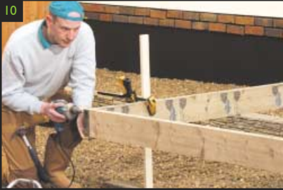
10 Attach the end beam using landscape screws.