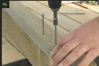
46 Pre-drill 2 landscape screws into position.