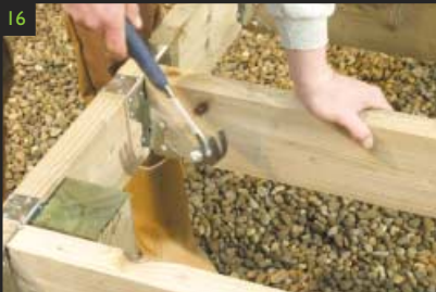
16 After treating the cut ends of the joist with End-grain, nail in place into the joist hanger. If you are using the contemporary handrail system you can now start to fix your deck boards.