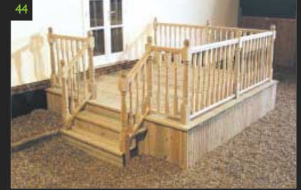
44 The finished deck fitted with the Arbordeck classic handrail. The sides of our deck have been cloaked with deck boards. Adequate ventilation has been provided to allow the substructure to dry after rain.