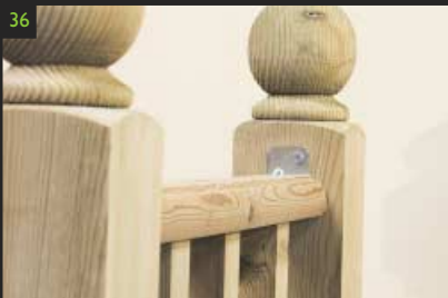
36 To prevent the top bracket being seen, fix the bracket so the vertical plate is above the top rail.