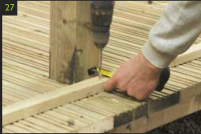
27 Once all the boards are fixed, determine the position of the edge of the deck. Attach a baton as a temporary guide line.