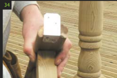
34 Fix the brackets using the screws provided.