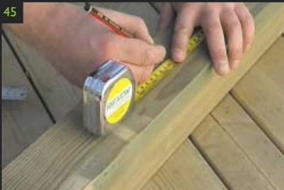
45 The top of the handrail should be 900mm from deck level. Mark this height on the newel post.