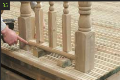
35 Use supports to help ensure the rail is level. Make sure there is sufficient space to fit the bottom angle brackets. Ensure the gap between the deckboard and base rail is no greater than 100mm.