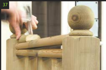
37 Gently knock the finished rail into place. Use an offcut to prevent damage to the rail.