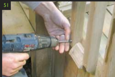
51 Calculate the spacing required on each spindle (max 100mm) and attach using a spacer as a guide.