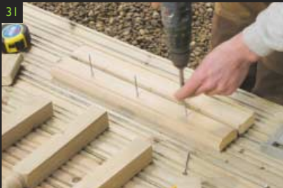
31 Starting from the centre mark the position of the spindles on the handrail. For easier fitting start the screws in position on the rail before attaching the spindles.