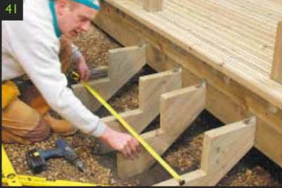
41 Attach additional stringers to ensure the maximum distance between them is no more than 400mm on centre.